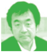
Kengo Kuma Japan