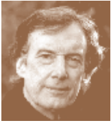
Charles Jencks USA