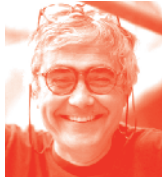
Rafael Vinoly USA